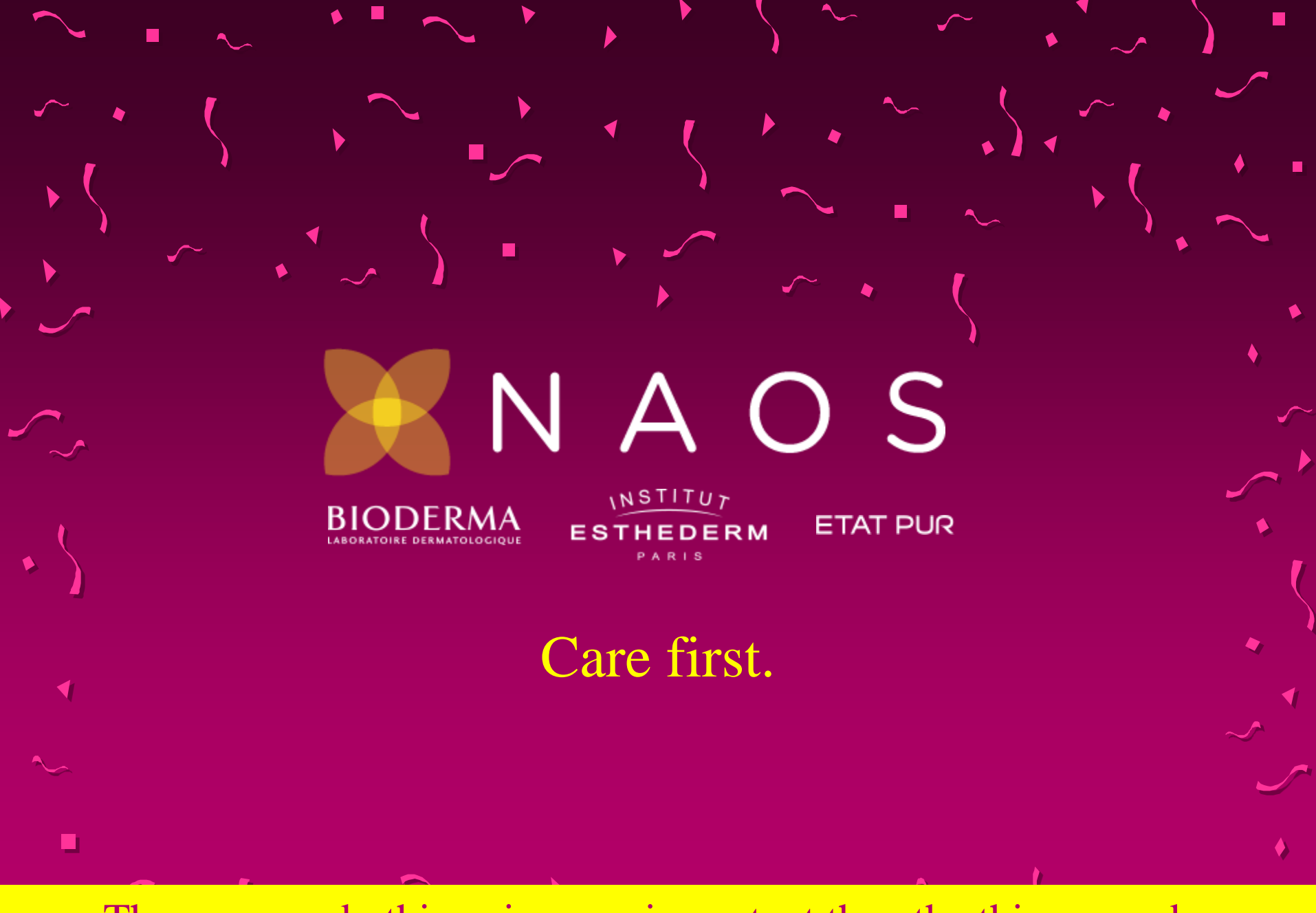
The way we do things is more important than the things we do.